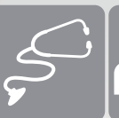
Mobile Physician Rounding